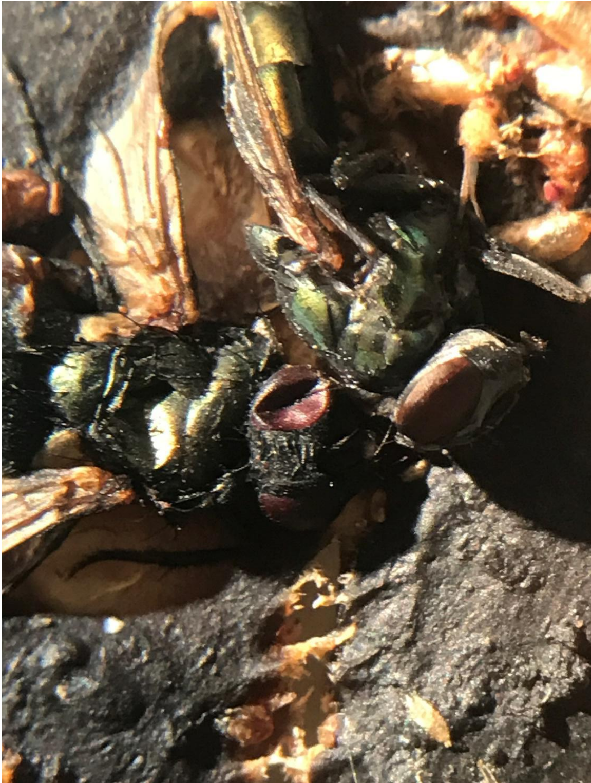
Figure 4: Simulated photo of the tongue of body (in practice this is of beef liver). Dead blow flies and empty pupa cases of blow flies are noted.