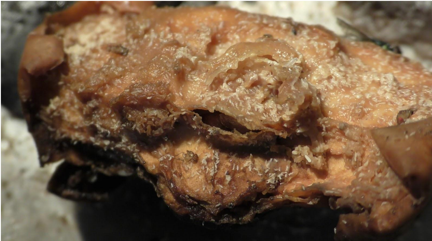
Figure 2: A close up photo of the decaying apple with egg cases and larvae of all stages and some pupa. Mostly Drosophila stages are present but with a few of the blow fly.