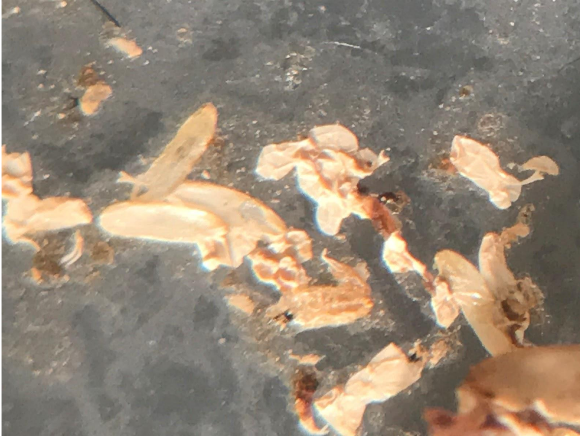
Figure 3: Several empty pupa cases of Drosophila were found on the ground rather than the apple.