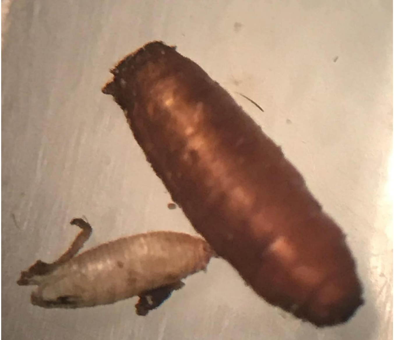
Figure 5: These pupae are found in the grass between the apple and the subject's face. The larger one is of the blow fly.

The activity is divided into flexible tasks for teachers to adjust as needed but to provide a logical framework for stepwise learning.