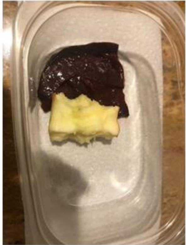
Figure 6: A plastic cage with screening to allow air in and out. Apple and beef liver placed inside along with adult Drosophila and blow flies

Task 5: Go over how to investigate individual fly species and effects of the environment on the developmental cycle. One can make agar plates with LPS within the agar or food and at different concentrations. D. melanogaster avoid eating food containing bacterial LPS. This gustatory avoidance was shown to be mediated through a TRPA1 receptor (Soldano, Alpizar Boonen et al...2016).