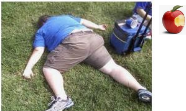
Figure 1: The body and apple in the location found